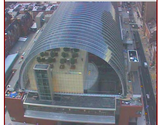
Aerial view of the roof of the Kimmel Center in Philadelphia, PA, another one of Boardman Steel's largest projects.